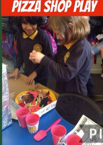
PIZZA SHOP PLAY